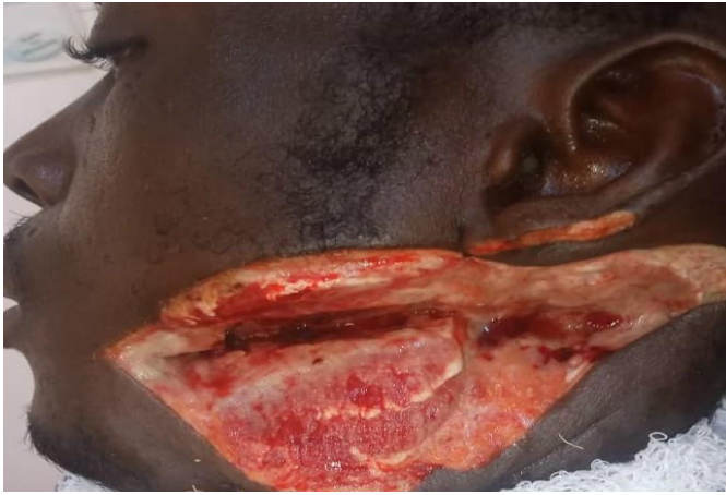
Figure 2a: Clinical photograph of another patient with machete cut injury