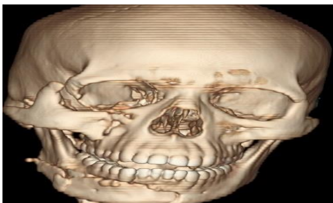
Figure 1b: Anterio-posterior 3D-CT scan showing the sites of fractures