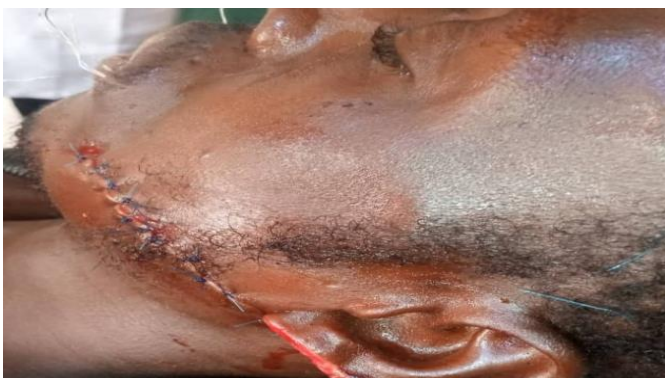
Figure 2d: Immediate postoperative photograph showing final wound closure.