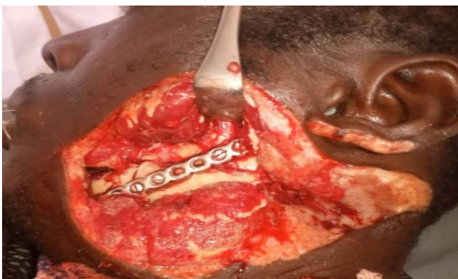
Figure 2c: Intraoperative photograph showing reconstruction plate that was placed under local anesthesia and conscious sedation.