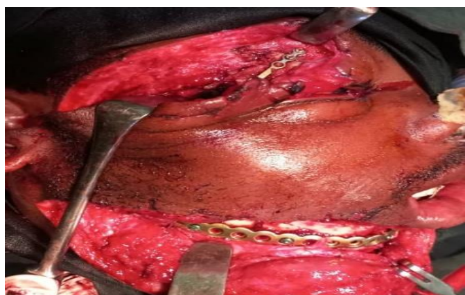
Figure 1h: Intraoperative photograph showing the two sites of fixation (mandible and zygoma)