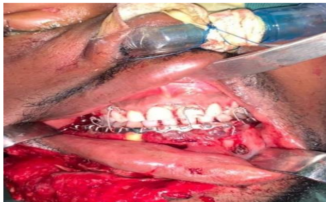
Figure 1f: Intraoperative photograph showing MMF done