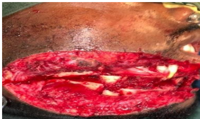
Figure 1g: Intraoperative photograph showing the comminuted mandibular fractures