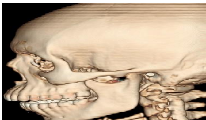
Figure 1d: 3-D CT view showing normal position of the left condyle in the same patient.