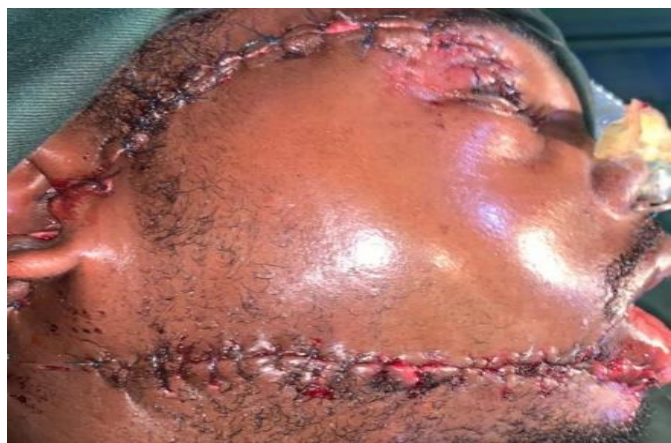
Figure 1i: Intraoperative photograph showing final closure of wound