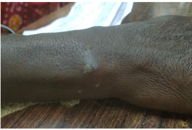
Fig.1: Before treatment