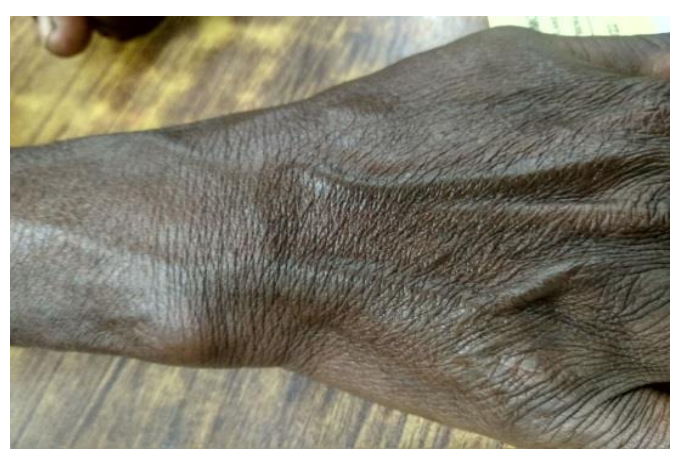
Fig.2: After treatment